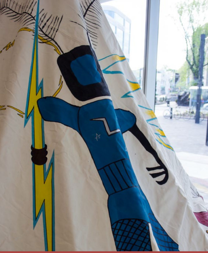
Thundermaker, Alan Syliboy

Modern libraries play an important role in fostering community growth. So—we must plan to be amazing over simply acceptable.